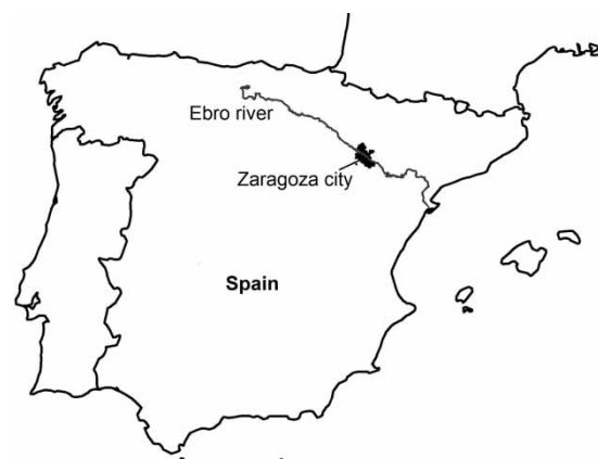
Figure 1 | Location of the city of Zaragoza.

The service of drinking water supply, sanitation and wastewater treatment in Zaragoza is managed by its City Council. As usual in Spain, the water consumed by the users is controlled by individual meters and taxed by a tariff system approved by the City Council. The water tariff system in Zaragoza in 2012 consists of a binomial system which combines a fixed charge based on the supply pipe size and a variable volumetric charge based on the volume