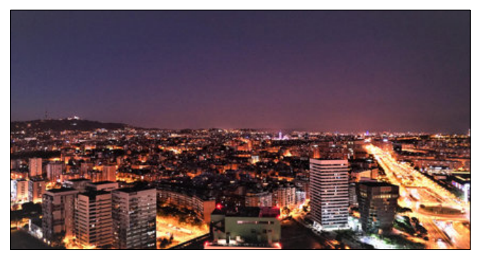
Figure 2: Barcelona